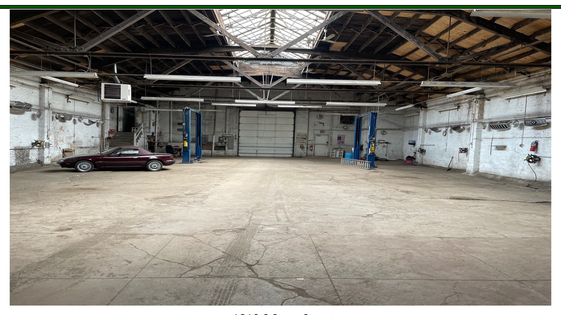
1819 S State Street Chicago, IL 60616