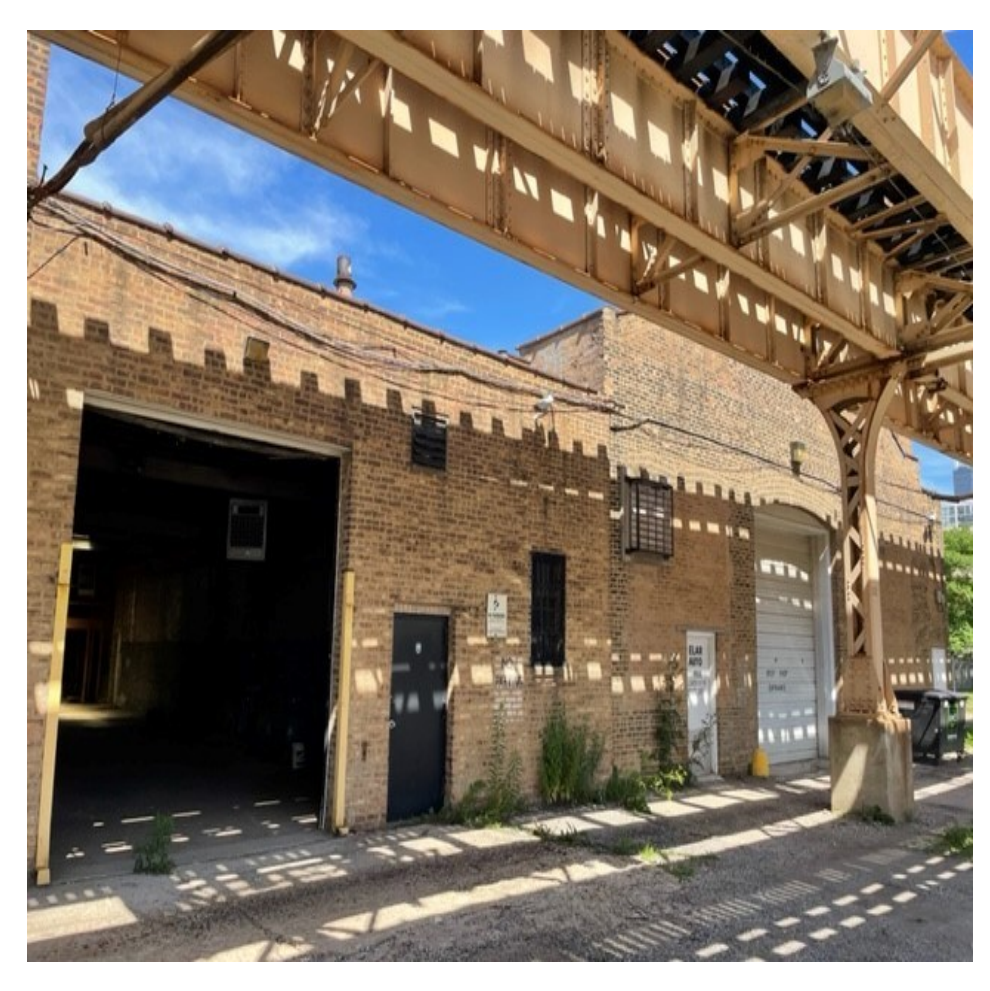
1819 S State Street Chicago, IL 60616