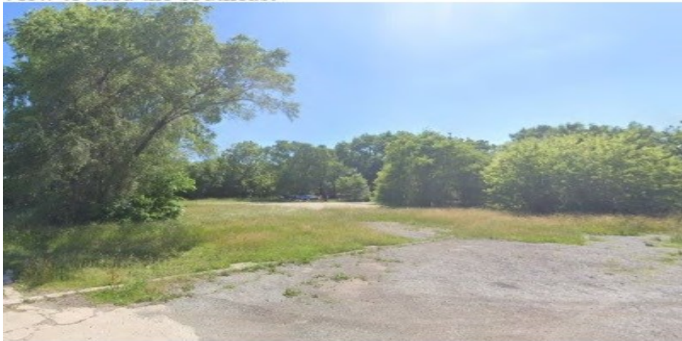
View toward the southwest