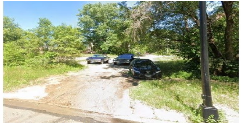
Curb cut along Wabash Avenue