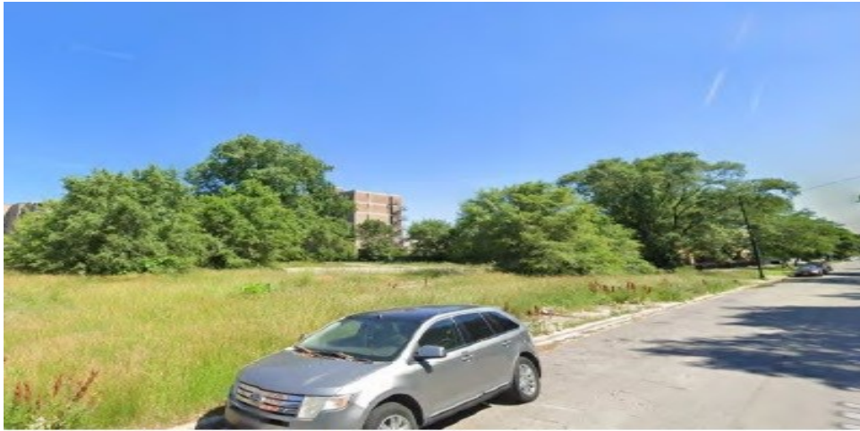
View toward the southeast